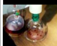
Hijama treatment in the UAE