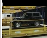
Dubai's robotic car park