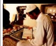
Sunset prayer at Bidya mosque